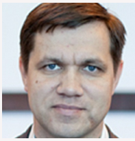
Vitaly Verkeenko Mayor of Vladivostok