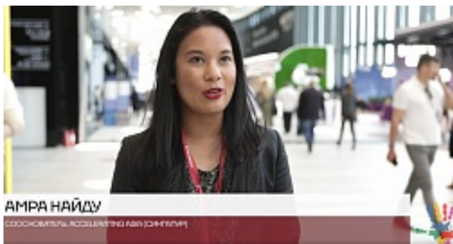
АМРА НАЙДУ СООКОВИТЕЛЬ АССОЦИЕЙТЕД ПАВ КОНГРЕССУ